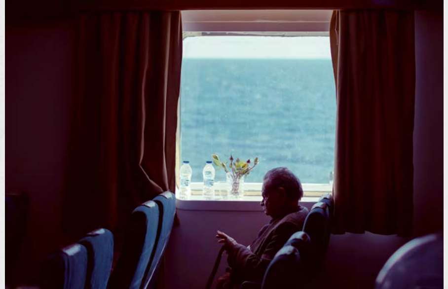
Father whose longing calls him to his son.