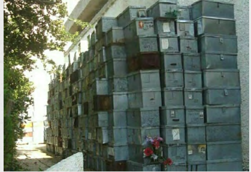
Greek burial crisis